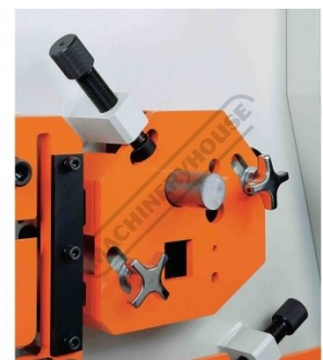
Round Bar Shear