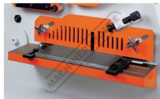
Flat Bar Shear