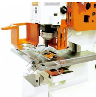
Work Table with Adj. Stops