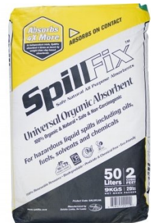
O000 SpillFix Universal Organic Absorbent