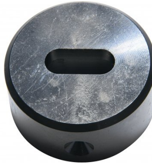
P6006 8.7 x 20.7mm Slotted Die