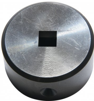
P6002 8.7 x 8.7mm Square Die