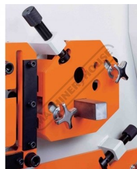
Square Bar Shear