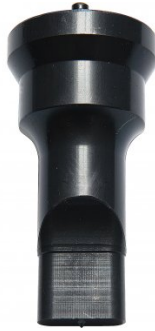
P6005 8 x 20mm Slotted Punch