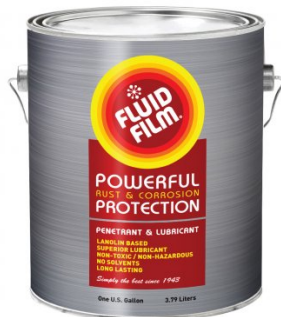
O044 Rust & Corrosion Preventive