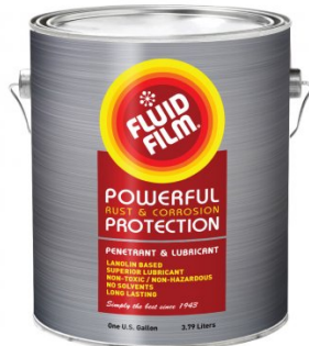
O044 Rust & Corrosion Preventive