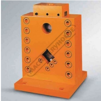
Optional Bar Shearing