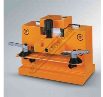
Optional Flat Bar Shearing