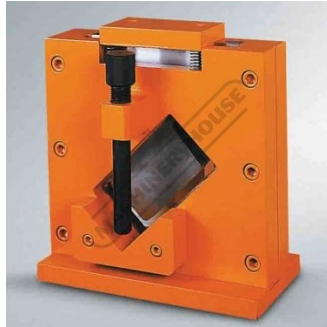
Optional Channel Shearing