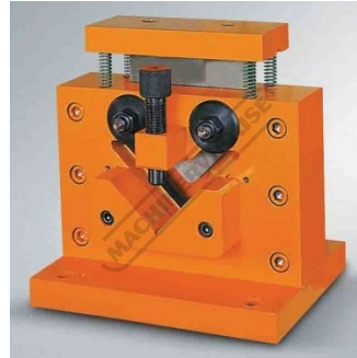
Optional Angle Shearing