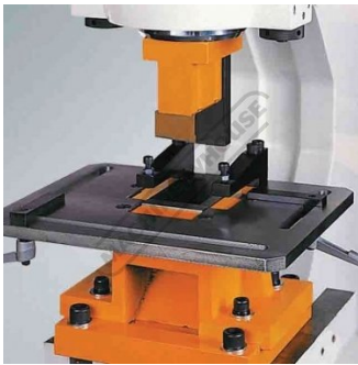
Optional Rectangular Notcher