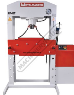
Table Height Adjustment Change