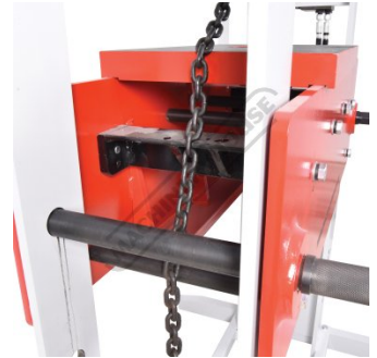
Table Height Adjustment Chain Slots