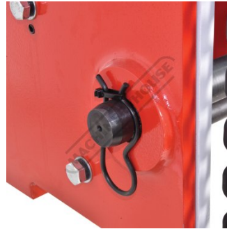
Pin Safety Clip