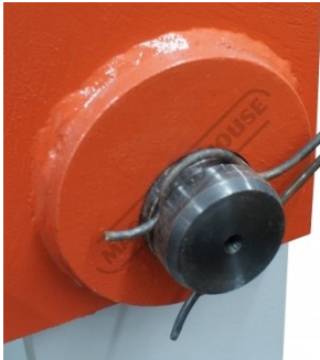
Pin Safety Clip