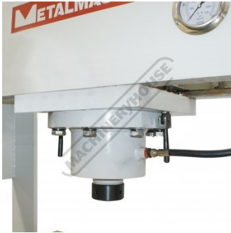
Sliding Ram Head Adjustment Handle