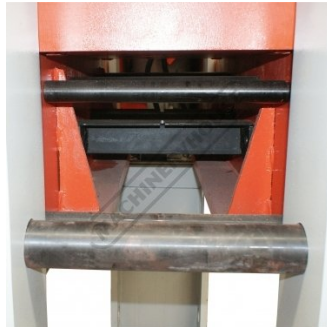
Table Chain Lifting Point