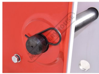
Pin Safety Clip