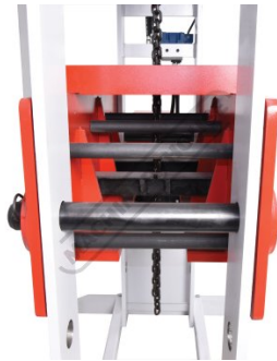
Table Height Adjustment Chain Slots