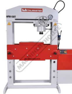
Ram moved to the right