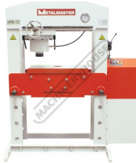
Front View Head Left Position