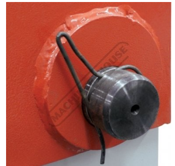
Pin Safety Clip