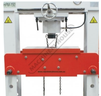
Table Height Adjustment Using Chain