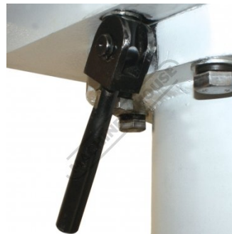
Head Locking Handle