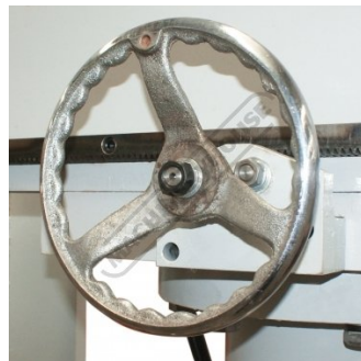
Head Movement Handle