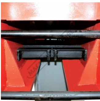
Table Height Lifting Points