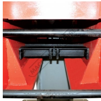
Table Height Lifting Points