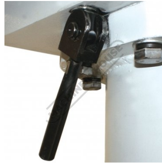
Head Locking Handle