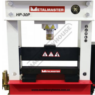
Shown with Optional Press