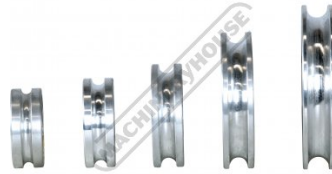
Round Formers Side View