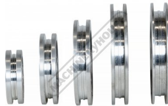
Square Formers Side View