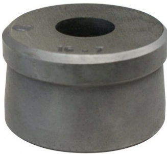
P734A Ø34.7mm Round Die - RDN2