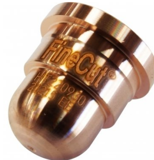
P842 Hypertherm FineCut Only Nozzle