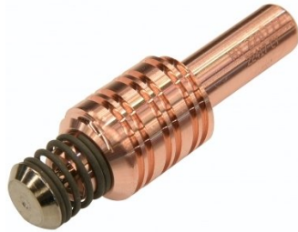
P8371 Hypertherm 45-105A Copper Plus Electrode