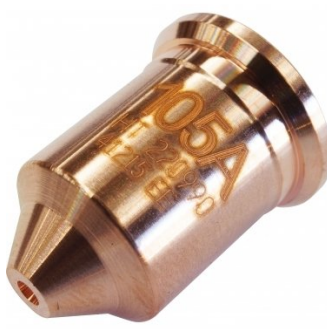
P841 Hypertherm 105A Nozzle