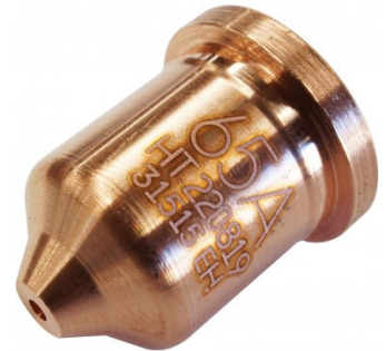
P839 Hypertherm 65A Nozzle