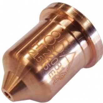
P840 Hypertherm 85A Nozzle