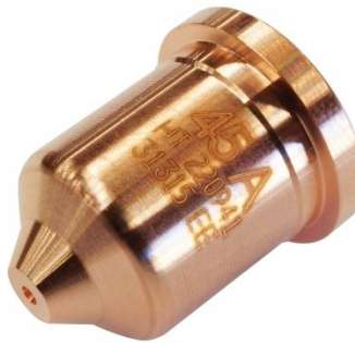
P838 Hypertherm 45A Nozzle