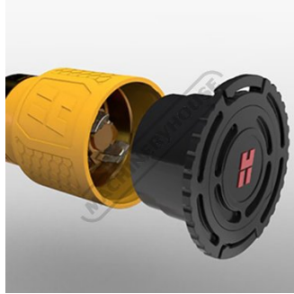
Shown with Optional Cartridge