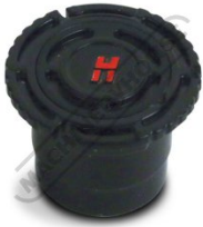
Cartridge NFC Reader