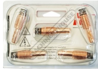
Packaging Rear View