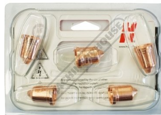
Packaging Rear View