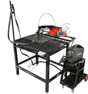
Optional Table and Plasma Torch Setup