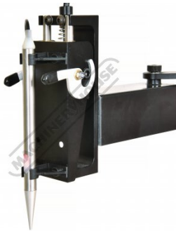
Trace Pen In Holder