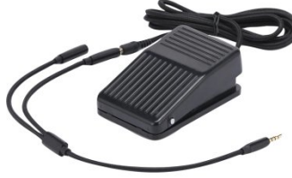
P8996 Foot Pedal For Simple Trace