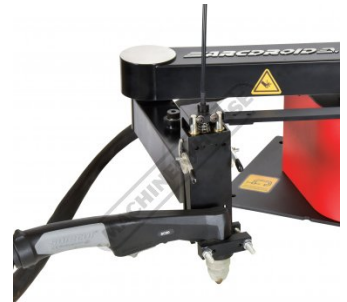
Plasma Torch Cradle