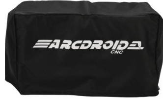
P8995 Machine Dust Cover