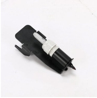
P8993 Marker Holder