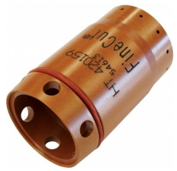
P858 Hypertherm FineCut Only Swirl Ring