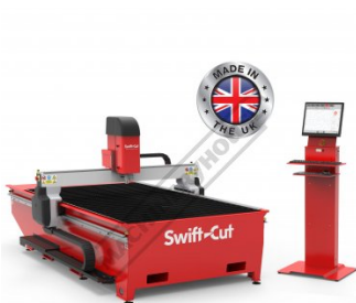
Pro 2.5m Made In UK