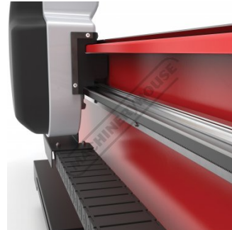
Linear Rail Rack-Side