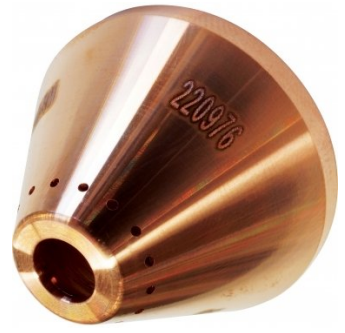
P854 Hypertherm 125A Shield