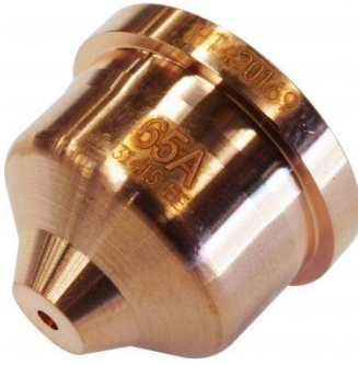
P851 Hypertherm 65A Nozzle