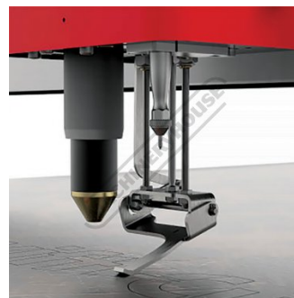
Initial Height Sense