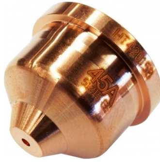
P852 Hypertherm 45A Nozzle