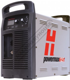
Supplied With Powermax125