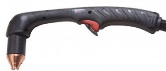
P8064 Hypertherm Hand Torch Cap