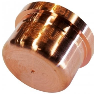
P853 Hypertherm FineCut Only Nozzle