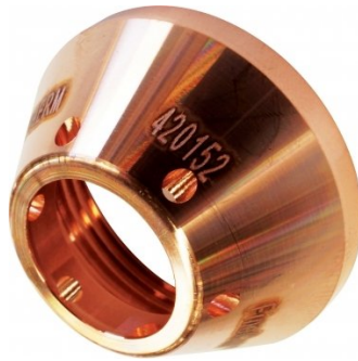
P856 Hypertherm FineCut Only Shield