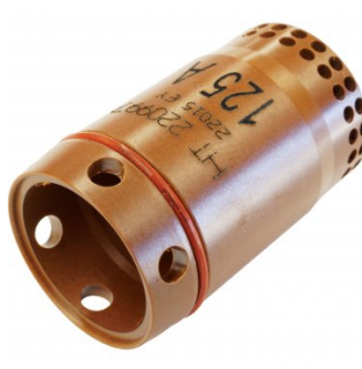
P857 Hypertherm 125A Swirl Ring