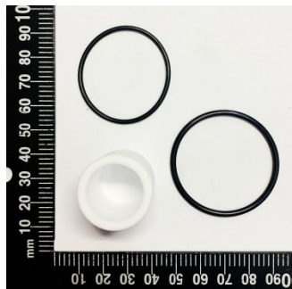
AP0001 Air filter element kit -Internal