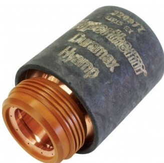
P859 Hypertherm 30-125A Retaining Cap