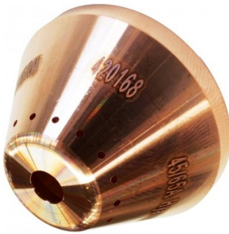
P855 Hypertherm 45-65A Shield