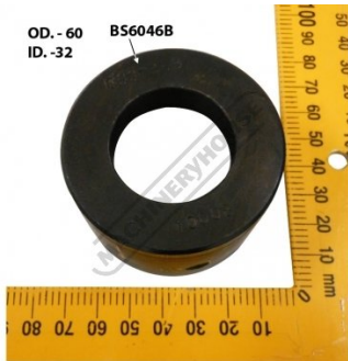
PP706 DIE BS6046B ADAPTOR 60 X 46mm