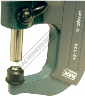
Shown with Ball Point Adaptor