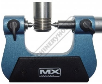
V shaped and cone shaped anvils