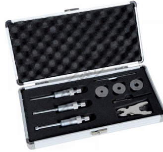
Foam Lined Aluminium Case