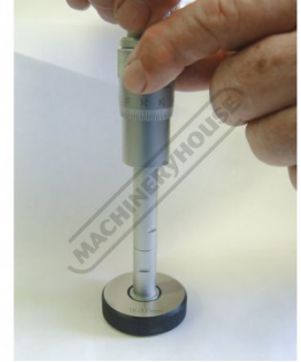
Shown with Setting Ring