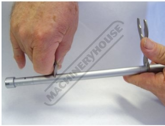
Shown Fitted with Extension Rod