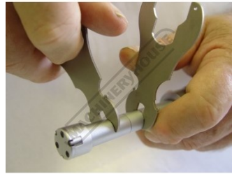
Spanners Shown In Use