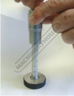
Shown with Setting Ring