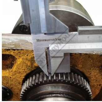
Shown measuring gear