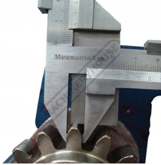
Shown measuring gear