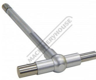
Spring Loaded Adjustable Movement