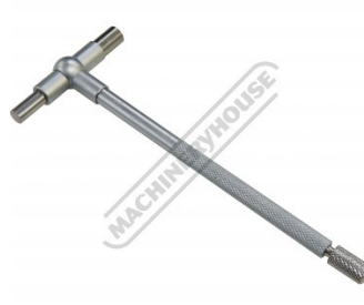
Knurled Handle Grip & Lock