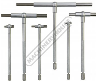
Metric & Imperial Comparator