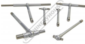
6 Piece Set