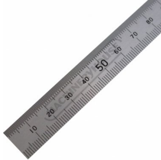
Metric Close Up