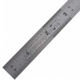
Imperial Close Up