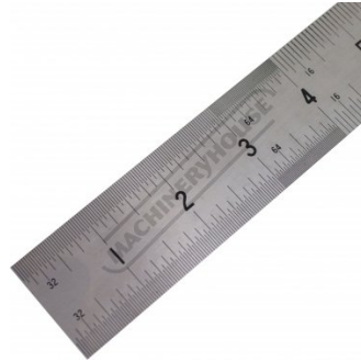
Imperial Close Up