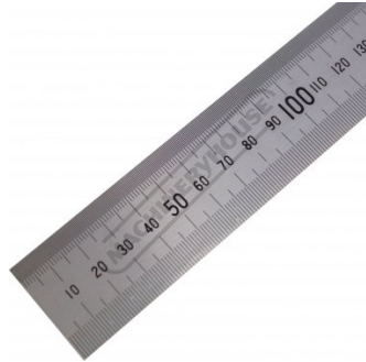
Metric Close Up