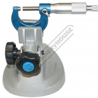
Shown with Optional Micrometer in Clamp Position