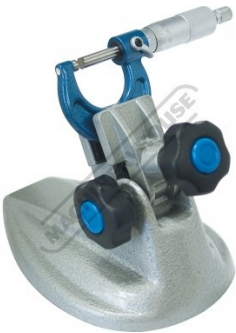
Shown with Optional Micrometer in Clamped Position