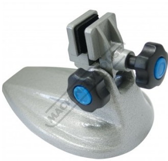
Front Angle View