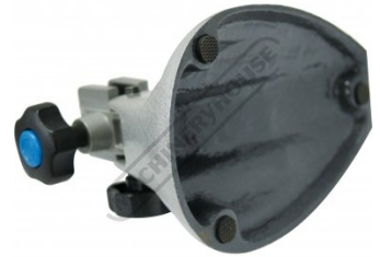
Rubber Foot Pads