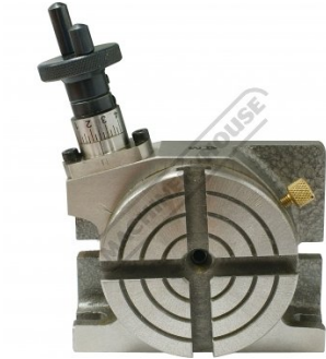
Front View on Edge