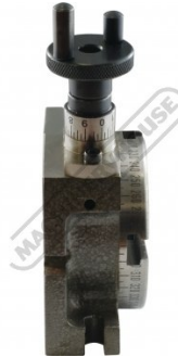
Side View on Edge