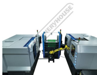
Shown Tending 2 Machines