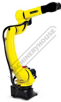
FANUC industrial robot