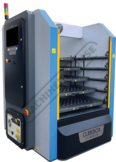
Operator Load side