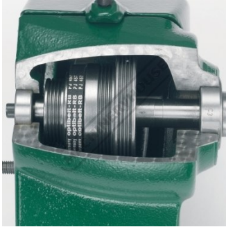
Solid Cast Iron Headstock