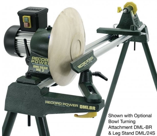
Shown with Optional Bowl Turning Attachment DML-BR & Leg Stand DML/24S