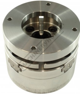
Shown With Faceplate Ring 62572