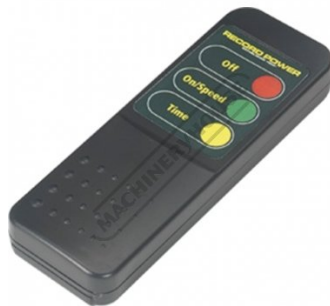
Remote Control Included