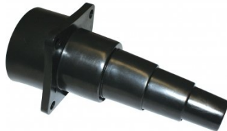
W334A Dust Hose Stepped Reducer