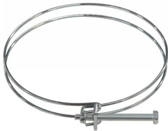
W341 Dust Hose Clamp