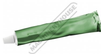
WG250 S Honing Compound