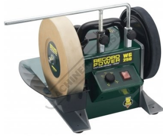
WG250 Wet Stone Sharpener