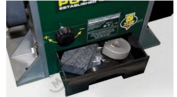
Integral Storage Tray