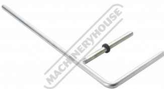
WG250 P Support Arm