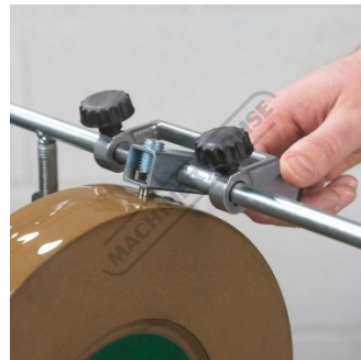
WG250 K Diamond Truing Tool