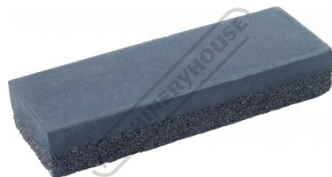
WG250 R Stone Grader