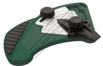
WG250 T Angle Setting Gauge