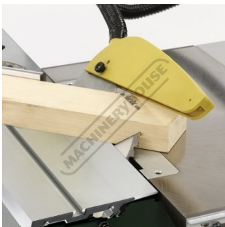
Easily Handles Compound Mitre Cuts