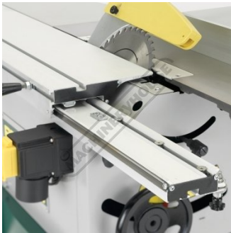
High Quality Sliding Beam