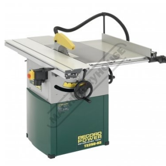
Shown in Standard Configuration