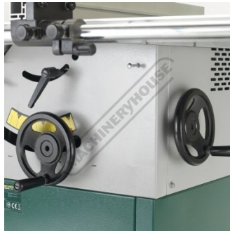
Rise and Fall