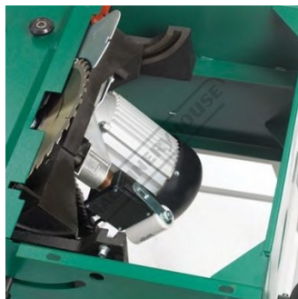
Whats on the Inside