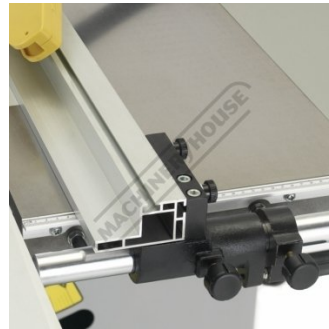
Robust Fence System