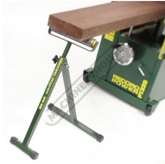
Shown in use with Thicknesser