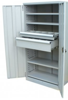
T762 Industrial Storage Cupboard