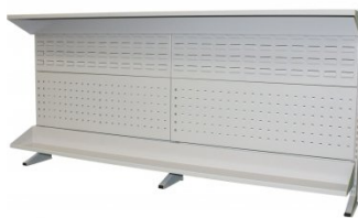
A426 Industrial Backing Panel - Bench Mount