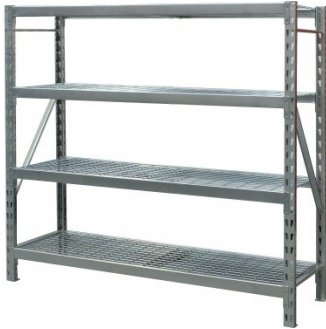
S014 Industrial Steel Shelving