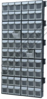
Few Buckets Shown Open