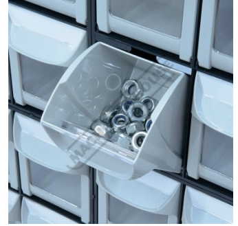
Bins Open Smoothly To a 40° Angle