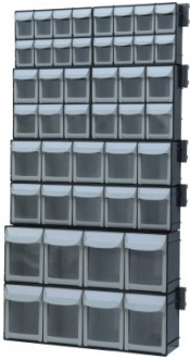
S0351 Parts Storage Bin System