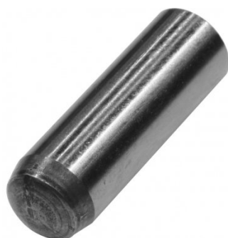
S095 Dowel Pin