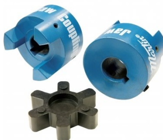
S097 Love Joy Coupling