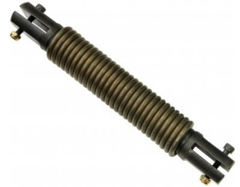
S099B Return Spring