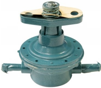
S098A Coolant Pump