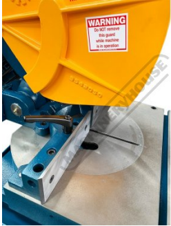
G Model Clamping