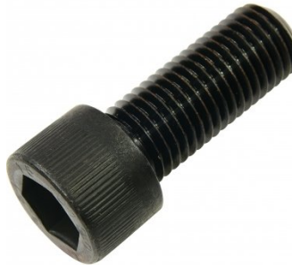
S093 Screw Retaining