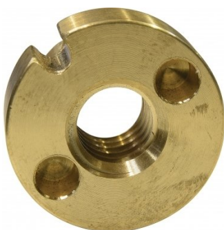
S096 Vice Nut - Brass Type