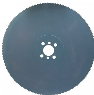
S137E HSS + COBALT Cold Saw Blade