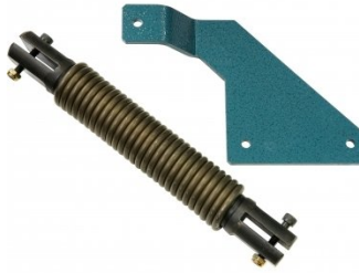
S099A Return Spring Conversion Kit