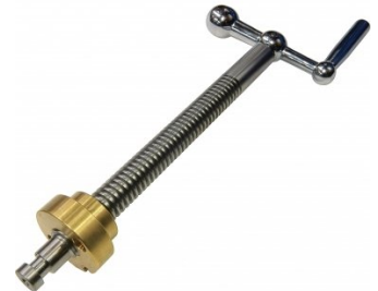
S094 Leadscrew Handle / Nut Assembly