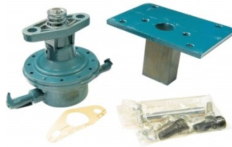
S098B Coolant Pump & Conversion Kit