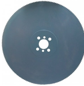
S137B HSS + COBALT Cold Saw Blade