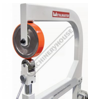
Shown Fitted To Wheel