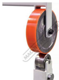
50 8mm Wide