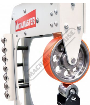
Shown Fitted On Wheel