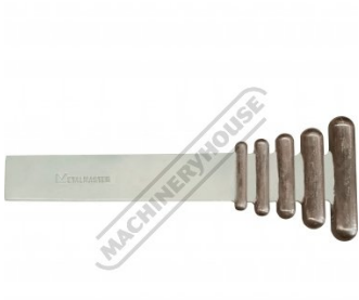
Stacked On Top