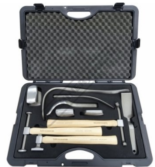
H887 Auto Panel Restoration Kit - Master