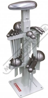
Stand Shown With Optional Dollies