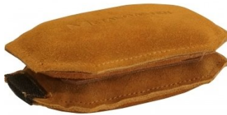
S212 Rectangle Leather Bags - Sand Filled