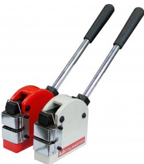
S2262 Shrinker & Stretcher - Bench Mount