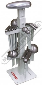
Stand Shown With Optional Dollies