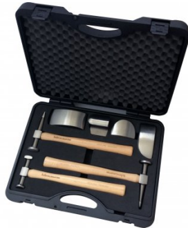
H886 Auto Panel Restoration Kit - Professional