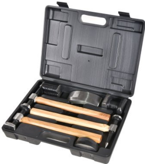
H885 Auto Panel Restoration Kit - DIY