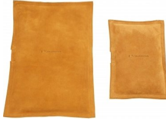
S212 Rectangle Leather Bags - Sand Filled