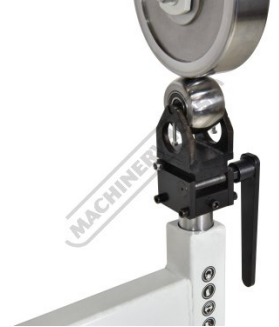
Cam Action Lever on Lower Die Rear View