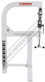
Side View Left