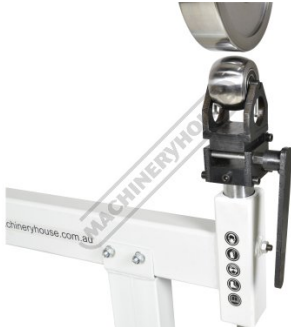
Cam Action Lever on Lower Die Rear View2