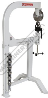
Rear view left