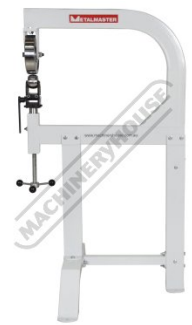
Side view right