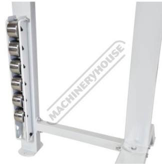
Roller Storage Pack