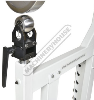
Cam Action Lever on Lower Die Rear View3