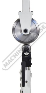
Roller End View