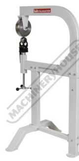
Rear view right