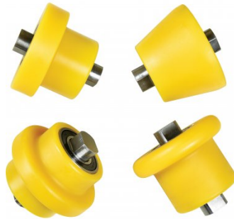
S2172 4pc Nylon Lower Anvil Set