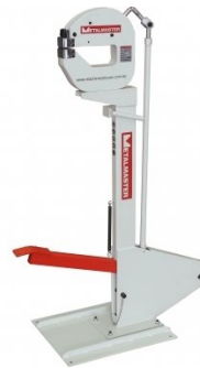
S2266 Foot Operated Shrinker Stretcher - Heavy Duty