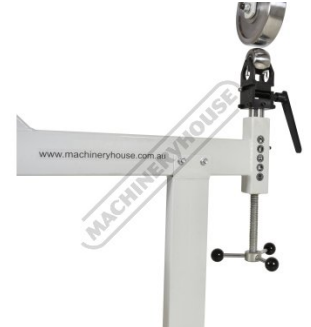
Material Thickness Adjustment Hand Wheel