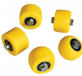
S2170 5pc Nylon Lower Anvil Set