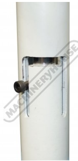
Quick Action Swivel Bottom Roller Die