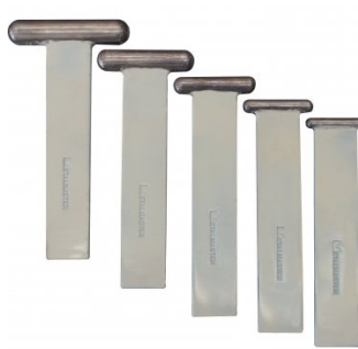
S223 Straight Steel T-Dolly Set Small - 5 Piece