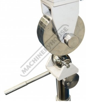
Roller & Die Head