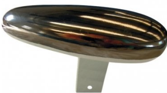
S2236 Oval Steel Dolly