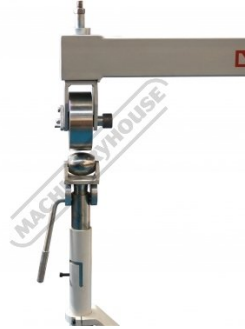
Cam Action Material Clamp head