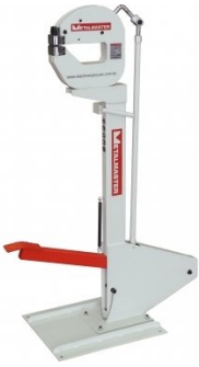
S2266 Foot Operated Shrinker Stretcher - Heavy Duty