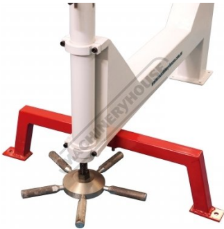
Fine Adjustment Hand Wheel