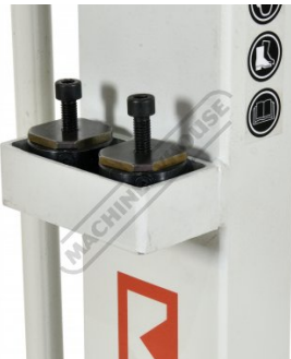
Die Storage Holder