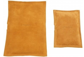
S212 Rectangle Leather Bags - Sand Filled